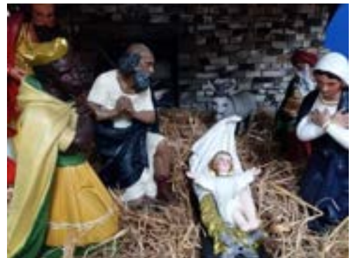
Gill renovated and re-painted the