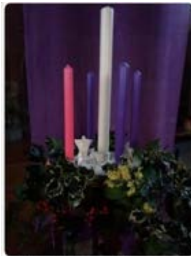
Gill made the porcelain candleholder for the Advent wreath with figures which illustrated the significance of each Sunday in Advent.