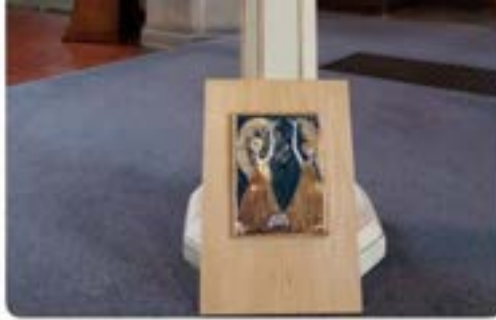
The last Station of the Cross being used to celebrate the Resurrection on Easter Day.