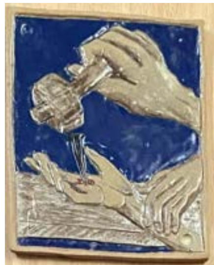
Stations Of The Cross